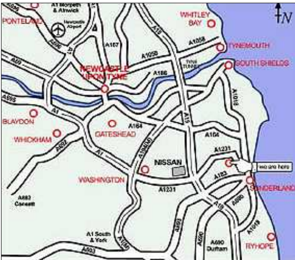
North East of England Business & Innovation Centre - Site plan

Unit 92 Silverbriar Sunderland Enterprise Park East Sunderland SR5 2TQ Tel: +44 191 516 6258